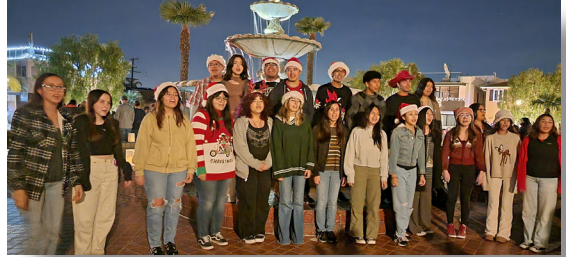
The Warren High School Choir on Luminaria night.