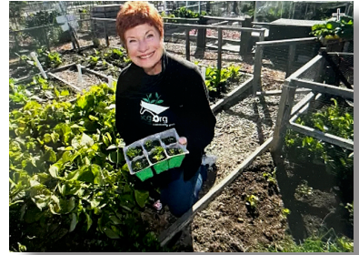
Long Beach Community Garden.