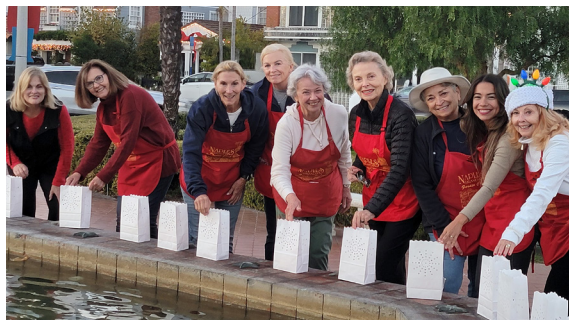
Luminaria Night Committee