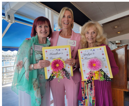
Flower Show winners