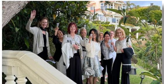
NIGC members enjoying the LaJolla Excursion.

NIGC scholarships are offered to students interested in careers in Horticulture, and who are planning to transfer to 4-year colleges upon completion of their studies at Long Beach City College. This year we awarded scholarships to two very worthy and inspiring students.